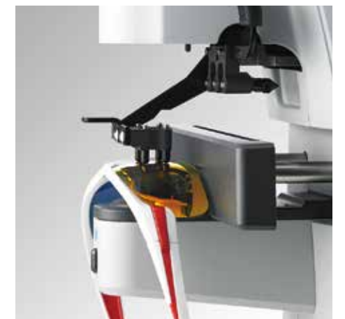
Mirror Lens Measurement