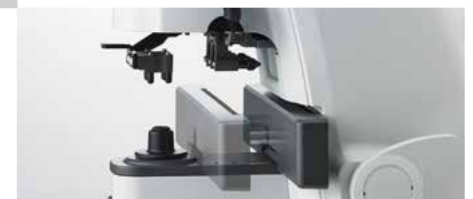
Minimize the Distance between PD Bar and Lens Support