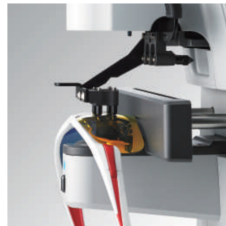
Mirror Lens Measurement

While measuring the refractive power of darkly-tinted or mirrored sunglasses, the CLM-1 will calculate the refractive power of the lens by automatically amplifying the amount of light without requiring any additional key strokes, the same way it measures normal lenses.