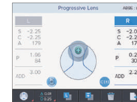
Progressive Lens Measurement

Measurement data can be shown on display with QR code.