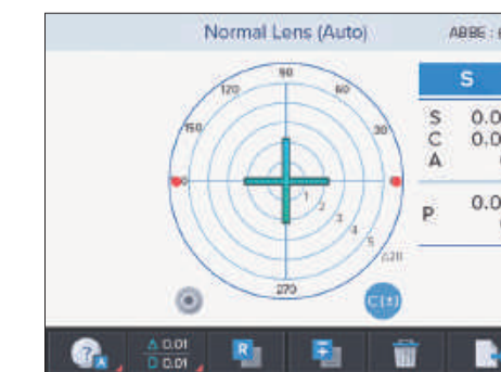
Auto Lens Recognition