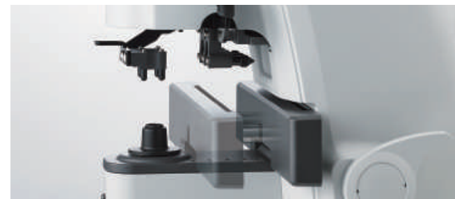
Minimize the Distance between PD Bar and Lens Support

CLM-1 can check transmission rate for 4 wavelength 395nm(UV),415nm(Blue - Low), 460nm(Blue - High),545nm(Green).